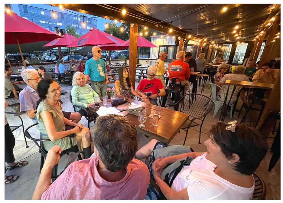
Thursday, August 3, marked the release of Bartram Trail Pale Ale at Athentic Brewing Company. Participants enjoyed a night of Bartram trivia.

Athens was an appropriate place for us to start the anniversary of Bartram's