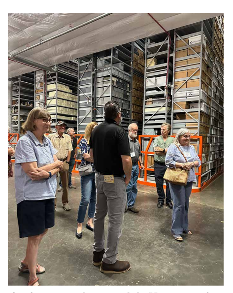
Conference members toured the University of Georgia Libraries archives.

Be sure to mark your calendar for June 1–2, 2024 when we will hold our next Bartram Trail Conference in Cowee, North Carolina.