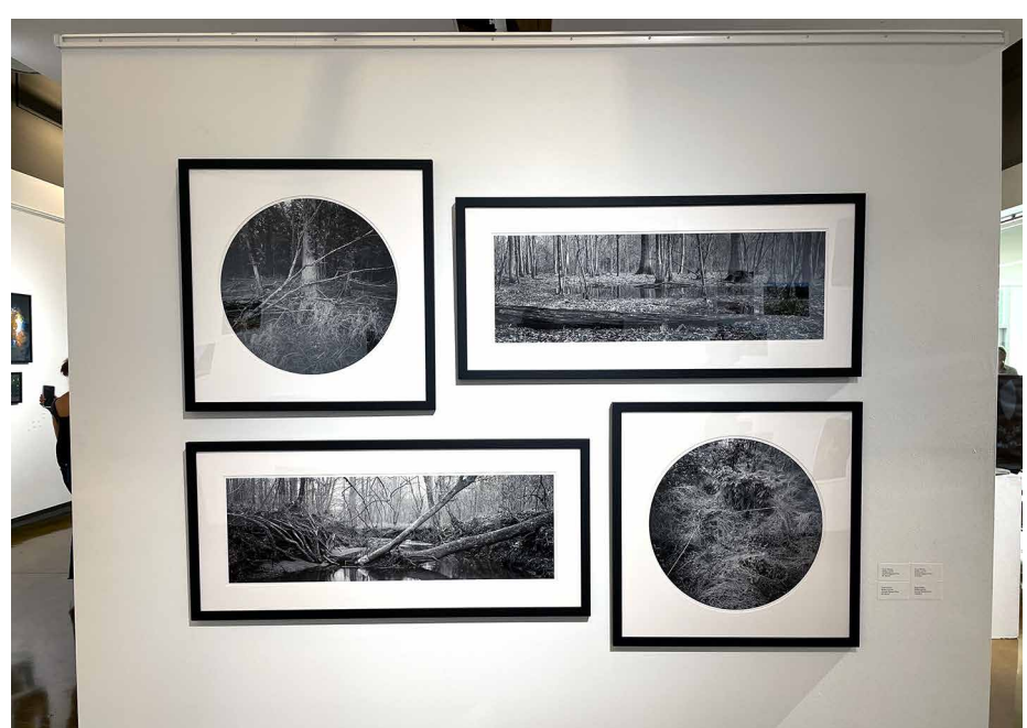
Photographs of the Great Buffalo Lick by Susan Patrice. The photo exhibit, With Rapture & Astonishment: Reimagining the Bartram Trail, had its opening reception at the UGA Circle Gallery during the Bartram Trail Conference in Athens. Twelve photographers followed in the footsteps of William Bartram to explore and reimagine a well-traveled landscape teeming with life.